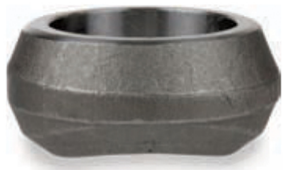
Fig. 43S03 – Socket Weld Outlet